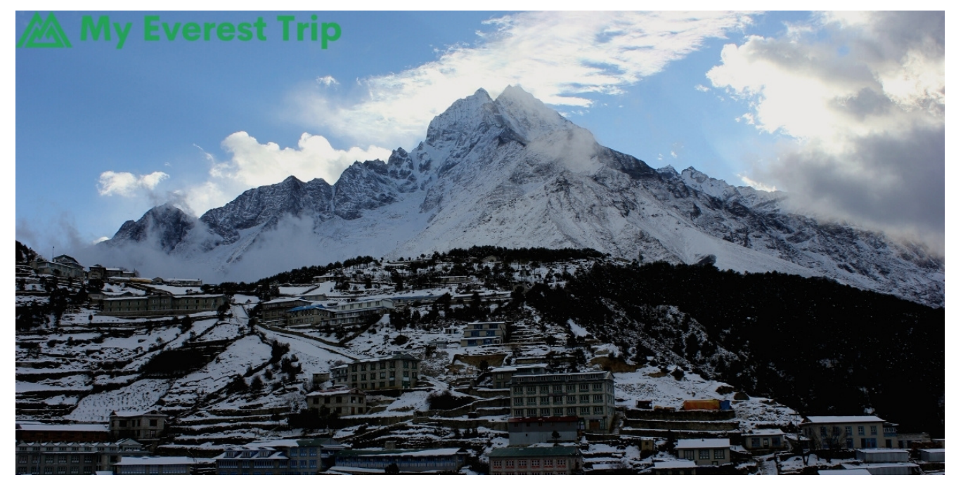
Namche Bazaar is popular with Trekkers in the Khumbu region.

We will stay here to acclimatize and trek to a museum showcasing the tradition and history of the Sherpa community. Here you will get a panoramic view of Everest (8848 m) and Ama Dablam (6812m). We hike up to Syangboche airport and then to Khumjung village (3800m), Sherpas's most significant known settlement, before hereturningturninge. O/N at the guest house.