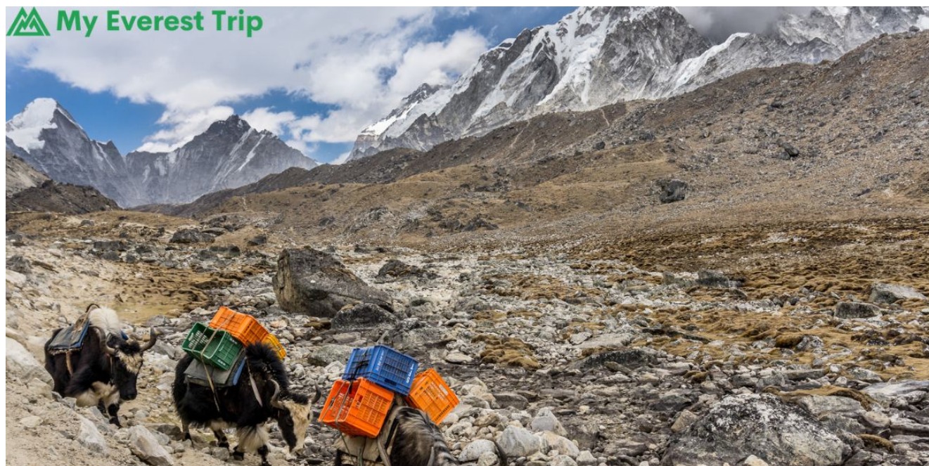
Lobuche Peak Trek

Although our guides have some oxygen cylinders, they might not be enough for long-term use. So you must be careful to keep yourself relaxed and hydrated. However, if the symptoms of altitude sickness start to get severe, we will climb to a lower altitude. In the worst case, we call for helicopter evacuation, which your insurance covers.